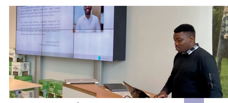
Start-up Impulse presenting