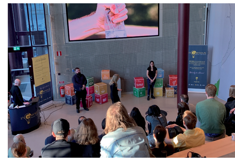
Final pitch in the inGenious Course

It is crucial that the challenge providers are genuinely interested in the students, their knowledge, and their way of thinking outside the box when being innovative. This type of collaboration is an excellent way for companies to get in touch with academia, get help being more sustainable, and find future employees. At the same time, the students learn that there is a huge and interesting labor market in the region. Students are challenged to operate outside of their comfort zone, resulting in more self-confidence.